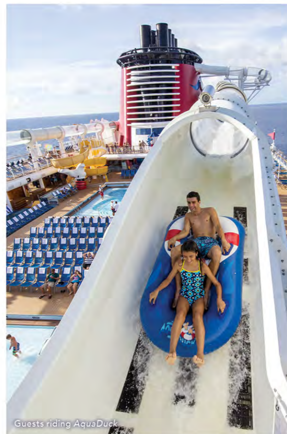
Guests riding AquaDuck

So if you dream of a getaway like no other, one that your whole family will love, make this dream come true by combining two magical adventures for one unforgettable Disney holiday.