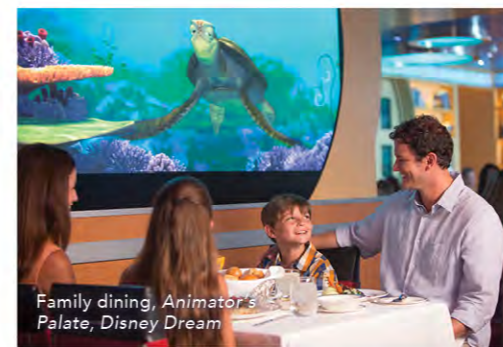
Family dining, Animator's Palate, Disney Dream

Enjoy Disney magic you won't find anywhere else. Sit spellbound through Broadway-style musical live shows, be awed by a spectacular sky of fireworks, enjoy special moments with popular Disney Characters and watch first-run Disney movies. Cast off on an award-winning holiday unlike any other, there's so much to enjoy with complimentary soda, tea, coffee and soft-serve ice cream. Discover fun and relaxation for everyone in the family on a Disney Cruise.