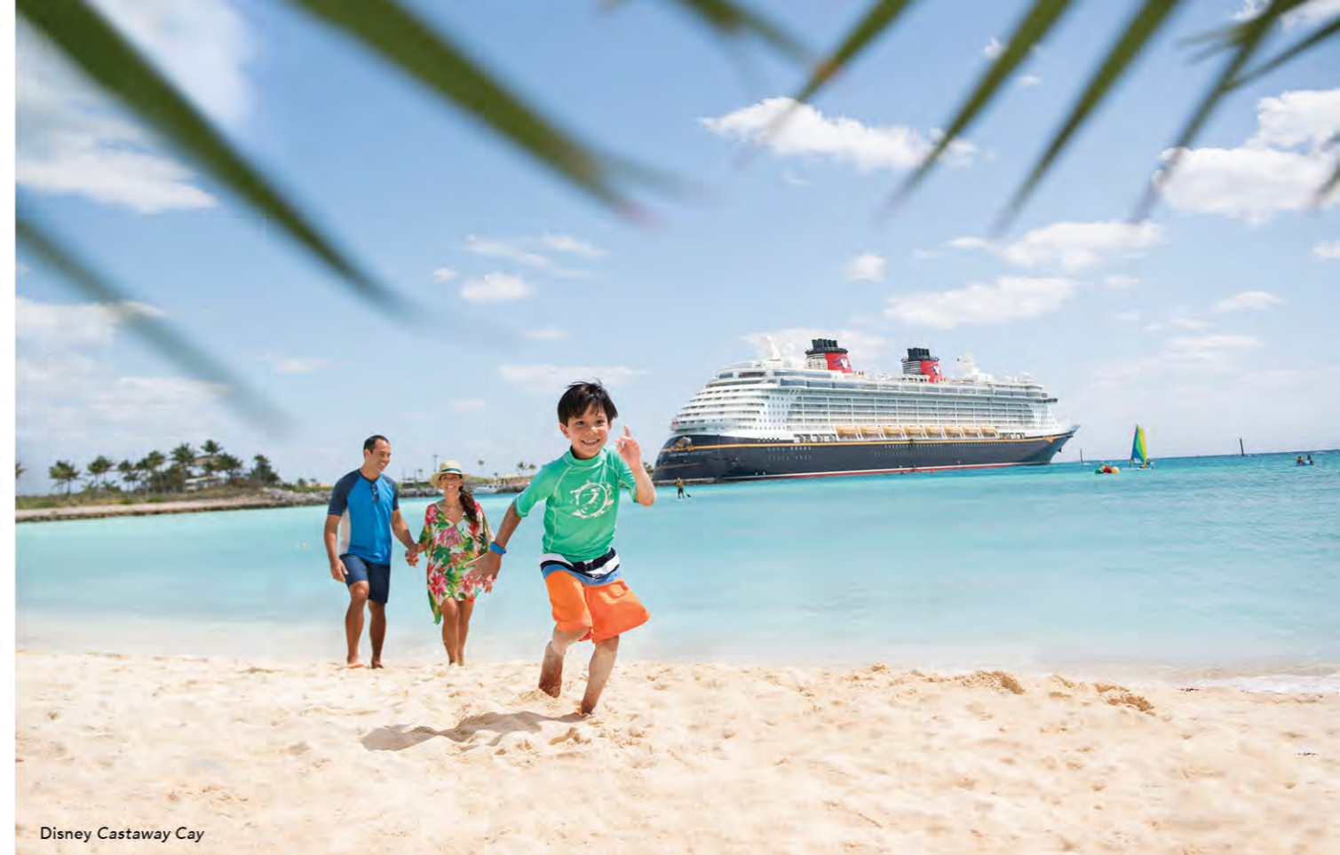
Disney Castaway Cay

Disney Wish – the newest ship to join the Disney Cruise Line family. Be among the first to experience to all-new enchantment on board, where fantastical worlds and beloved stories from Disney, MARVEL, Star Wars and Pixar are brought to life like never before. You won't want to miss out!