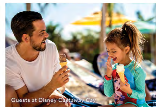
Guests at Disney Castaway Cay

Immerse your family in Disney tales as old as time or new adventures with friends from Pixar, Marvel, Star Wars ™ and beyond. Because there's something for everyone on board your Disney cruise.