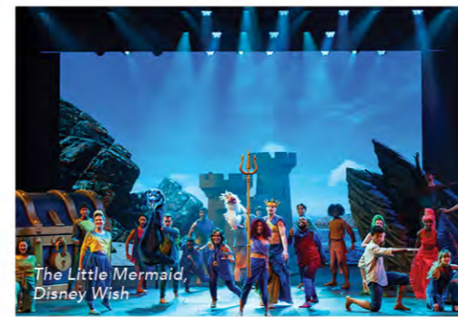
The Little Mermaid, Disney Wish

Build in flights, a Walt Disney World Resort hotel, Disney Park tickets - plus your Disney cruise, and transfers too.